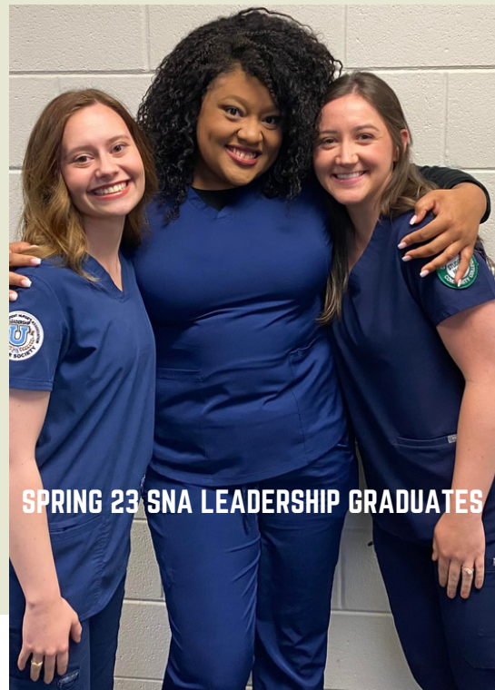
SPRING 23 SNA LEADERSHIP GRADUATES

https://www.facebook.com/ColumbiaStateSNAfacebook.com